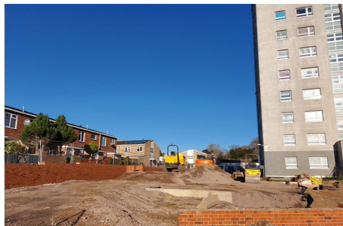
Area 1A being prepared