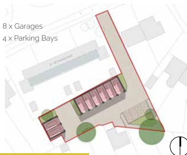
51 - 65 Wensley Road

The construction of the garages and resurfacing at 51-65 Wensley Road will be carried out first. Works are anticipated to start on site in May 2021.