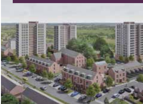
Aerial View of Phase 1 & 2